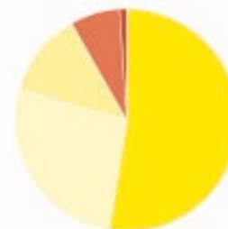
Acres - White

** Chenin Blanc, Pinot Blanc, Gewurztraminer, Semillon