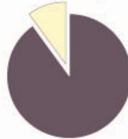
Acres - Total

White varietals: approximately 10% of total planted acreage.